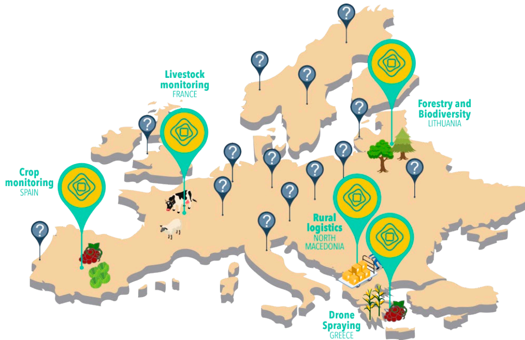
Figure 1: ICAERUS use cases